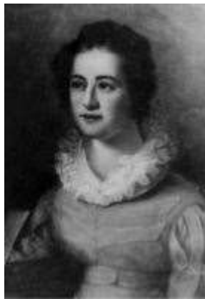
Ann Hasseltine Judson